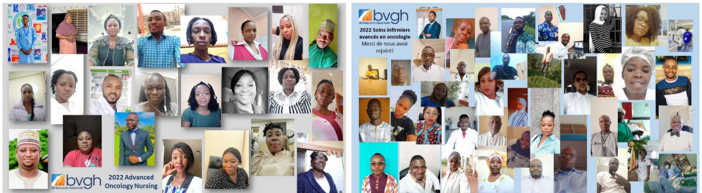
Advanced Oncology Nursing Anglophone participants.