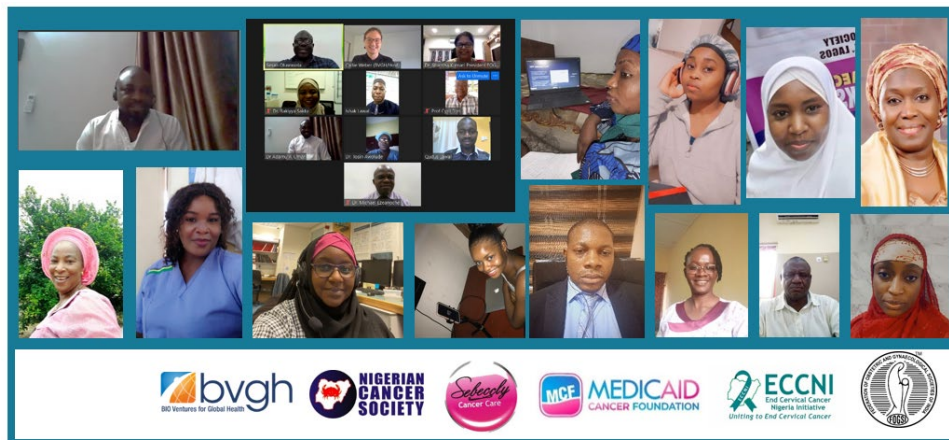
Pre-Invasive Disease of the Cervix course participants.

Resource stratification is a tool that uses available resources in a logical sequence to achieve the best possible care for patients. Often used in low- and middle-resource settings where the full spectrum of tests and treatments may not be available, resource stratification can help healthcare providers best use the options available to them. To support use of this valuable tool for cervical cancer screening services in Nigeria, BVGH held a three-day lecture series in partnership with the End Cervical Cancer Nigeria Initiative (ECCNI), Nigerian Cancer Society, Sebecly Cancer Care, and Medicaid Cancer Foundation. The digital program, which was attended by more than 380 participants, featured lecturers from Germany, India, Nigeria, South Africa, and Zambia who covered topics ranging from cervical cancer screening basics and counseling patients to the treatment of pre-cancers and the importance of screening program data management.