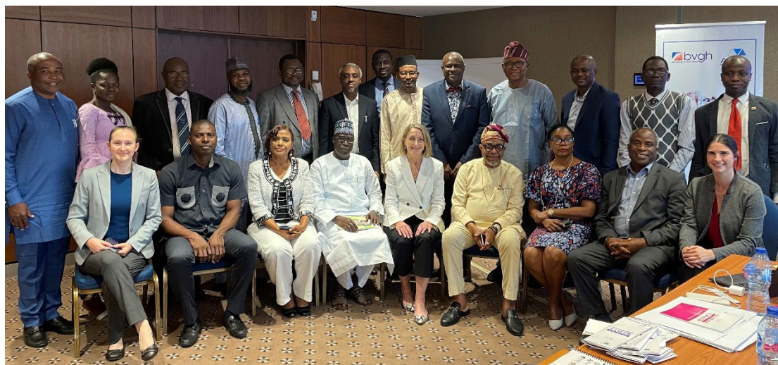
2022 AAI Nigerian Cancer Stakeholders Meeting attendees.