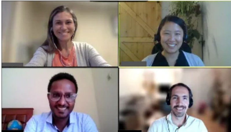
Digital lecture co-organizers from Hawassa University, City of Hope, and BVGH.