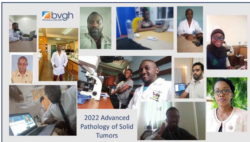
Advanced Pathology of Solid Tumors participants.