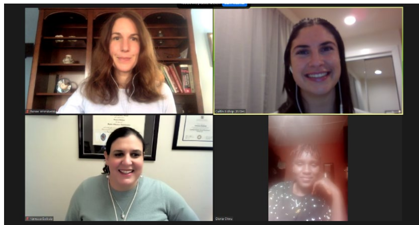
Course trainers, Project PINK BLUE, and BVGH.