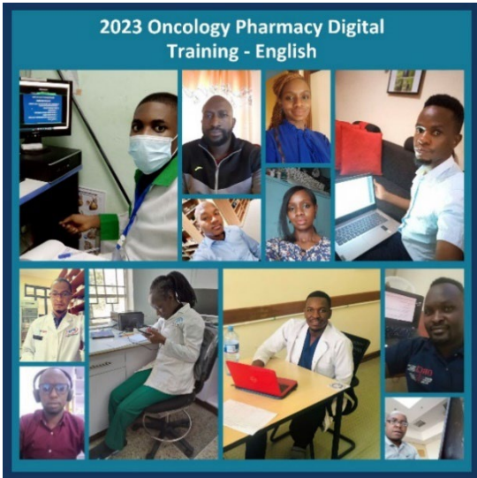
Participants in the 2023 Oncology Pharmacy Digital Training – English lecture series.

BVGH collaborates with African hospitals and non-governmental organizations to gain a broad perspective on improving cancer care in our partner countries. In partnership with Project PINK BLUE and funded by ACT Foundation, strong advocates for Nigerian cancer patients along every step of the treatment pathway, BVGH teamed up with trainers from the USA and expert consultants from Nigeria to organize Upgrade Oncology: Training for Nurses and Clinical Oncologists . Drawing over 400 participants from 14 countries, this six-lecture course addressed patient care along multiple steps in the cancer care pathway, including counseling patients before treatment begins, supportive cancer treatment, cancer pain management, and cancer emergencies.