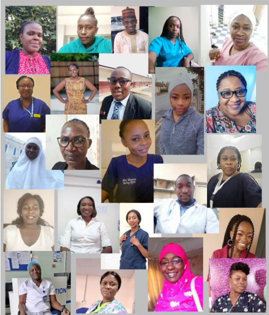
Participants of the 2023 AAI Nurse's Role in Research Digital Training Program.