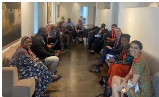
Members of the HypoAfrica Team gather at the AORTIC conference.

BVGH recently attended the World Cancer Leaders' Summit, 2023 African Organization for Research and Training in Cancer (AORTIC) Biennial Meeting, Nigeria's International Cancer Week, and the Bloomberg American Health Summit. We value these opportunities to strengthen ties with partners, as well as make new connections to accelerate improved cancer patient outcomes in Africa. During the 2023 AORTIC meeting in Senegal, BVGH held a prostate cancer-focused event, bringing together AAI partners and collaborators from around the world.