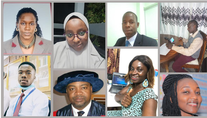
Participants of the 2023 AAI Palliative Care Digital Training Program.

Although essential for enhancing the quality of life of cancer patients – especially those with late-stage disease, access to palliative care services is limited in Africa. In response to requests from several AAI partner hospitals, BVGH developed a 12-session AAI Palliative Care Digital Training Program . Among other topics, lectures from the training series covered how to break bad news to patients and their families, pain and wound management, prognosis communication, and common symptoms associated with end-of-life care. Organized in collaboration with Hauteville Public Hospital Center, Balsam – The Lebanese Center for Palliative Care, and the Palliative Care Interdisciplinary Curriculum, BVGH’s palliative care program trained a total of 1,894 healthcare professionals from 53 different countries.