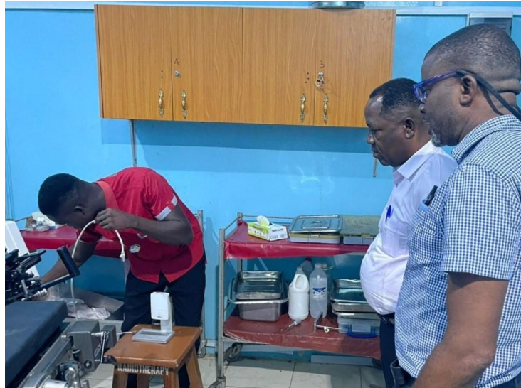
ASI Ukpo staff observe proper applicator insertion on a phantom dummy at UCH Ibadan.