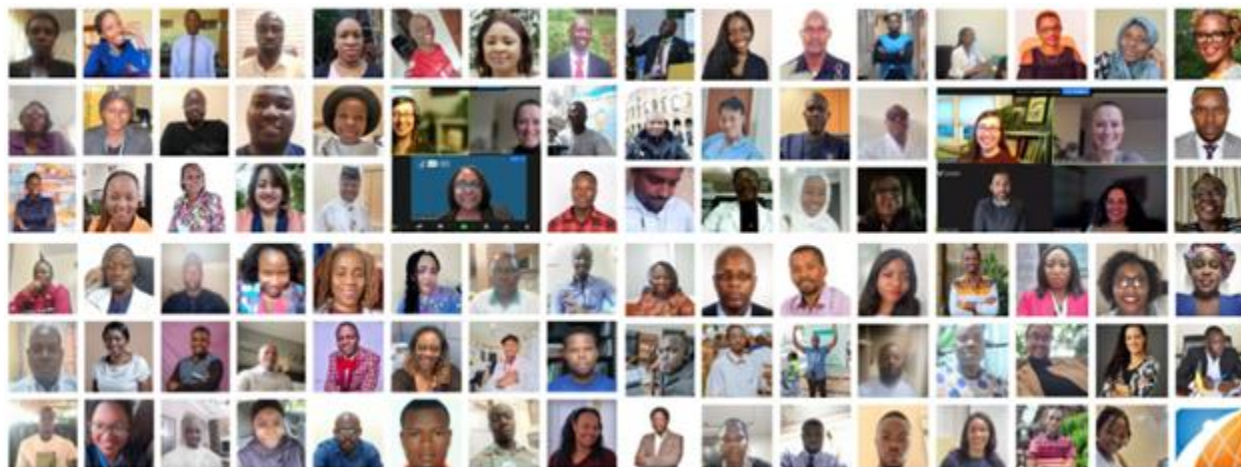
Introduction to Grant Writing digital course participants

Applying for grants and fellowships is a crucial part of moving innovative research projects forward, expanding educational opportunities, and increasing cancer care availability at hospitals. Yet the application process can be daunting and discouraging. To help demystify the funding application process, BVGH created the 2023 AAI Introduction to Grant Writing digital course. Reaching over 5,200 healthcare providers, researchers, and grant writing professionals from 102 countries, the lecture series included speakers from the National Institutes of Health (NIH), Wellcome Trust, Memorial Sloan Kettering Cancer Center, MD Anderson, and the University of South Florida.