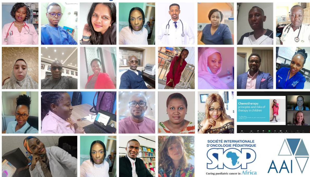
Participants of the AAI Introduction to the Treatment of Pediatric Cancers course

In low- and middle-income countries, pediatric cancer patients have a survival rate of 20-30%. In contrast, children with cancer in a high-income country have an 80% survival rate. The disparities in survival rates of pediatric cancer patients are due to several factors, including healthcare providers' limited training in pediatric oncology and insufficient awareness of pediatric cancer amongst members of the public.