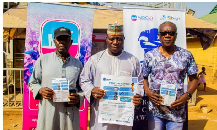
Community leaders of the Kado Kuchi Community showcase prostate cancer awareness materials at the Kampe Man awareness event

BVGH also launched its prostate cancer awareness program in Nigeria: Kampe Man, which emphasized the importance of prostate cancer screening and awareness to men in rural areas. We look forward to continued awareness activities through our new Let's Talk About Cancer program.