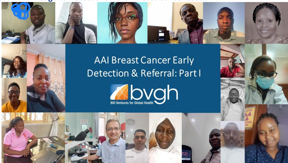
Participants of the AAI Breast Cancer Early Detection & Referral Part 1 course

In collaboration with the National Cancer Control Program in Kenya, BVGH launched the AAI Breast Cancer Early Detection & Referral Part I digital training program late last year. This 6-session series focused on the multidisciplinary aspects of the early detection of breast cancer and was tailored to meet the needs of pathologists, laboratory technicians, nurses, and other members of the cancer care team at county referral hospitals in Kenya. The second part of the series, which is planned for the first half of 2025, will focus on radiologic topics of breast cancer detection, including operationalizing mammography systems, using a breast ultrasound, imaging quality control, and more.