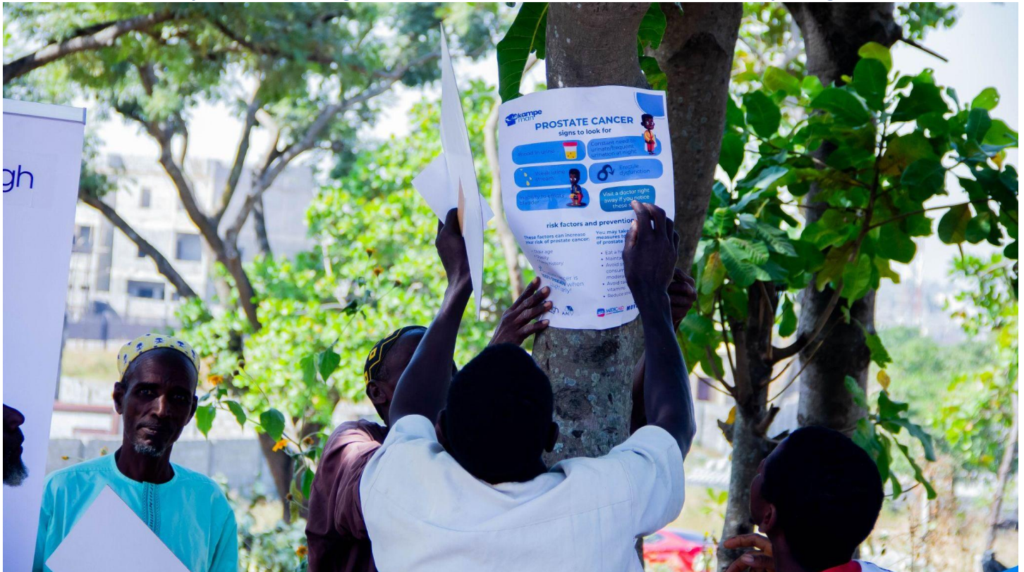
A prostate cancer awareness poster being placed on a tree in the Fulani Settlement as part of the Kampe Man campaign